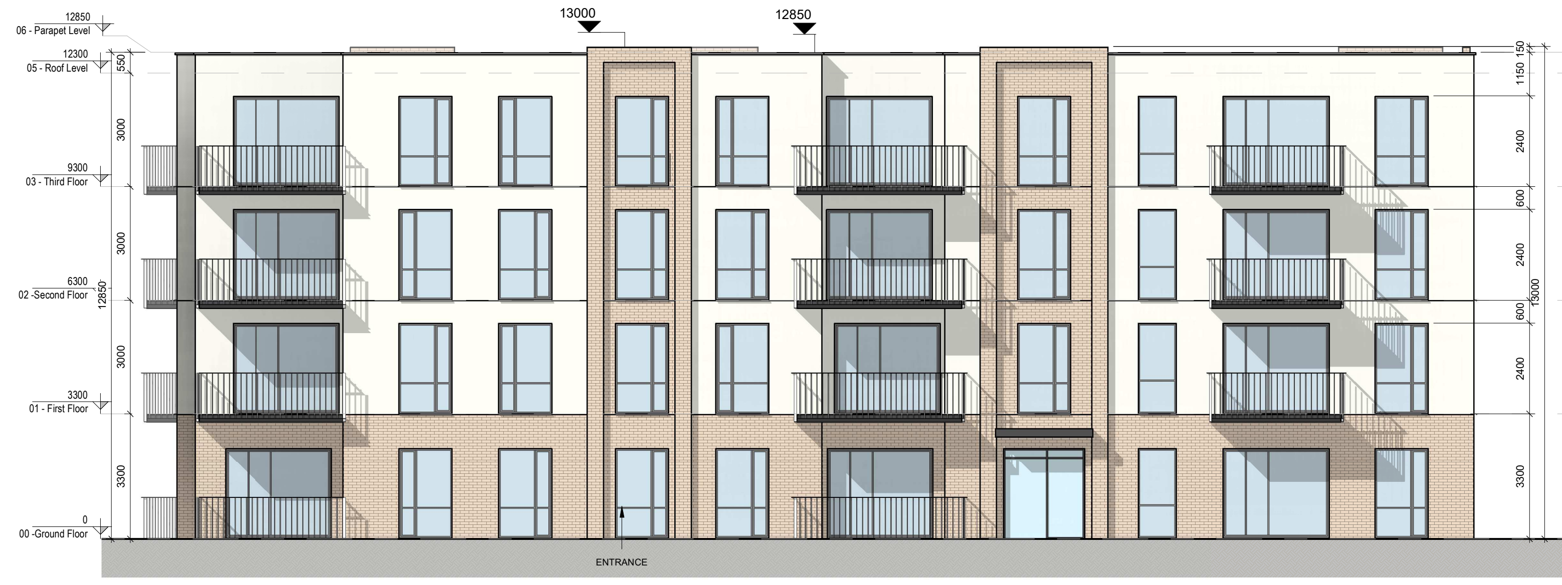
1 Front Elevation 1 : 100