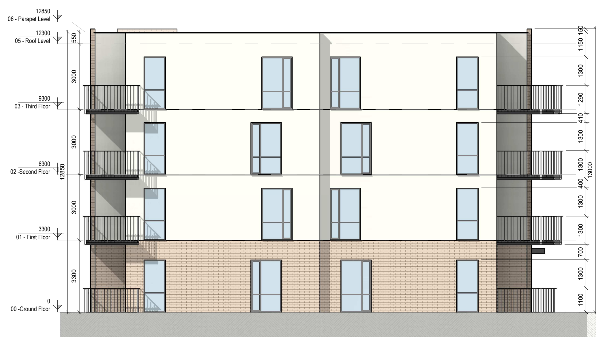
4 Side Elevation 1 1 : 100