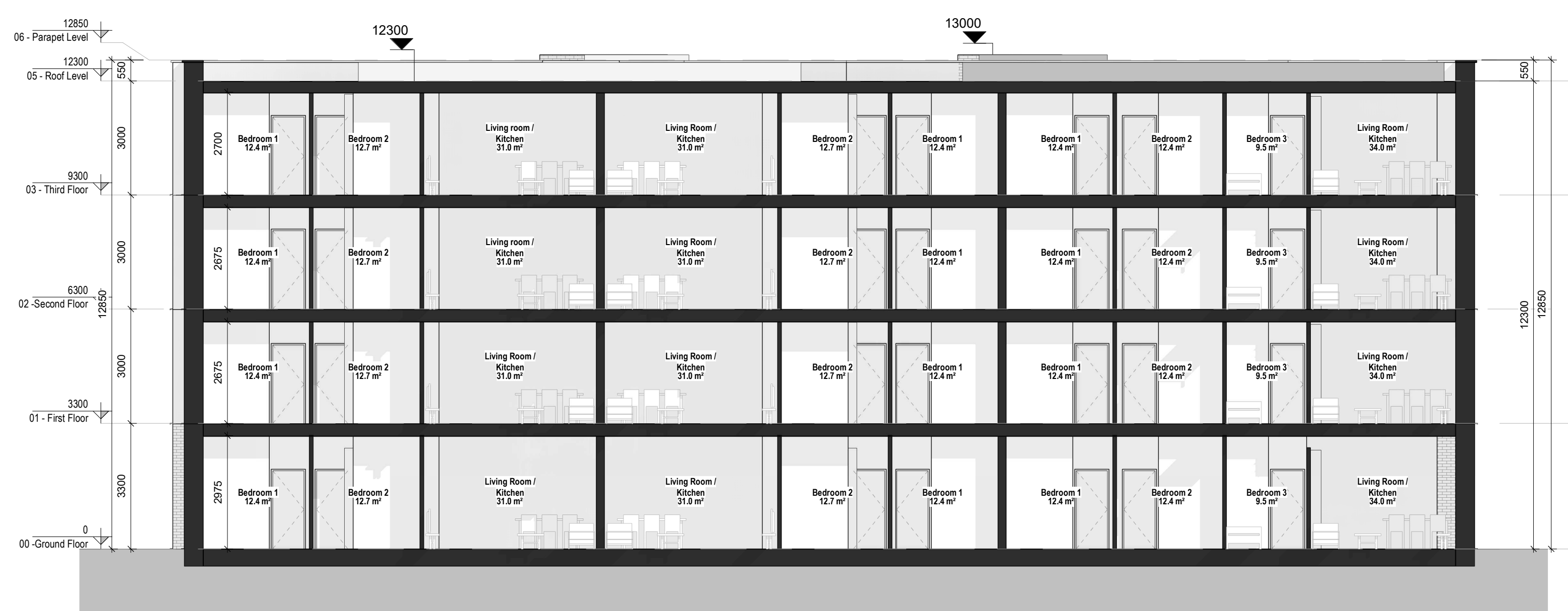
5 Section B - B 1 : 100