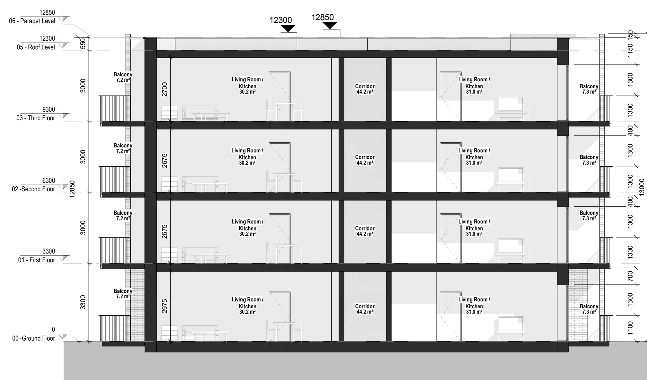
6 Section A - A 1 : 100