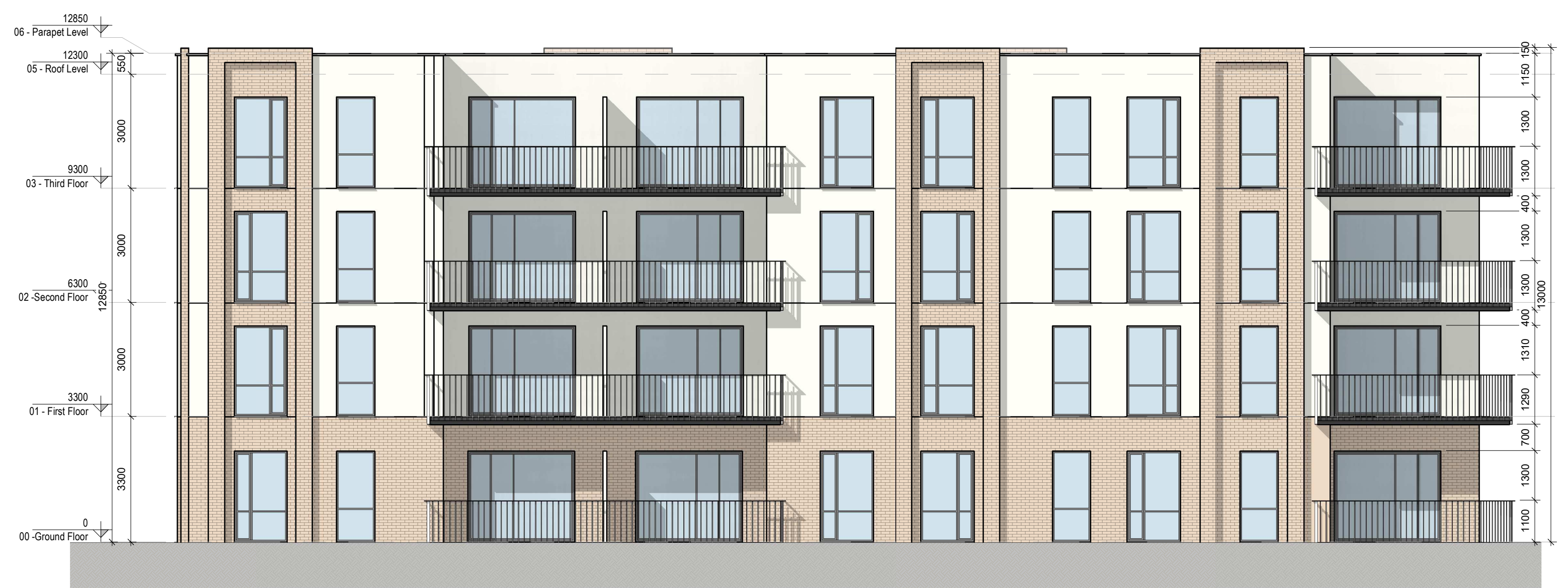
2 Rear Elevation 1 : 100